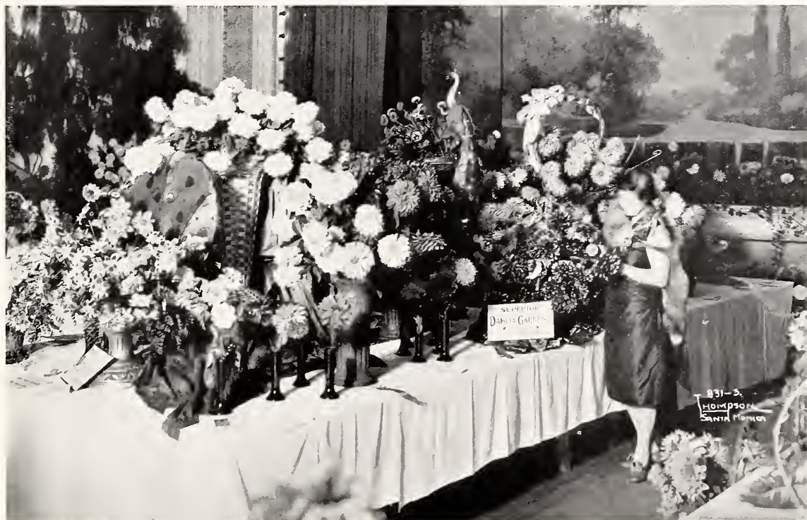
One of our previous shows that took six first prizes.